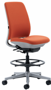
Amia stool Armless