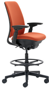
Amia stool Fully adjustable arms

Color shown may vary from actual colors. Please use actual surface material samples