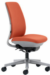
Amia chair Armless