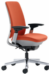
Amia chair Fully adjustable arms