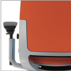
Upholstered Outer Back

Available with standard or sewn upholstery in Steelcase and Designtex fabric, leather,