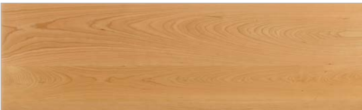
Cherry solid wood - after aging